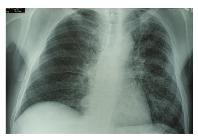
Fig. 1. Miliary tuberculosis

On admission the patient was conscious, with psychomotor agitation, without logical contact and with body temperature of 38.8°C. On GCS he scored 10 points. Physical examination revealed : neck stiffness 4cm, positive bilateral Kerning's sign, positive right side Oppenheim's sign, dehydration, quiet vesicular sound, palpable left supraclavicular node, as well as inguinal nodes and dental decay. Laboratory tests revealed elevated inflammatory parameters (CRP- 35.9mg/l, ESR-58/70, WBC-10k), mild hyponatraemia (131mmol/l). In the next 24 hours lumbar puncture was performed. Cerebrospinal fluid (CSF) examination revealed polinuclear pleocytosis, elevated protein concentration and low glucose level (Tab.1.). Due to abnormalities observed on the chest x-ray indicating miliary tuberculosis (Fig.1.) antituberculotic treatment was commenced (Rifampicin 600mg/d, Pyrazinamid 1500/d, Nidrazid 300mg/d, Streptomicin 1.0/d). In addition antioedematous drugs