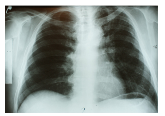
Fig. 2. Miliary tuberculosis - partial regression of changes

ria). CSF test plays a vital role in suspected tuberculosis etiology. CSF lymphocytosis, elevated concentration of proteins, and reduced concentration of CSF glucose suggest diagnosis. In CSF examination at the beginning of the patients hospitalisation, in addition to typical deviations in protein and glucose levels, polinuclear pleocytosis was found, which can occur in the initial phase of the disease (10). Glucose concentration in CSF (23mg/dl) fully met the criterion level of less than 60% of the concentration in the blood serum (94mg/dl). The growth of Mycobacterium tuberculosis in culture of the CSF sample is still the best standard in diagnosis of tuberculosis. Unfortunately, traditional microbiological tests have low sensitivity and long waiting period for positive results, while new and faster molecular tests (bacterial DNA amplification by PCR) remain expensive and inaccessible in routine hospital diagnosis. Although these tests have positive predictive value and high specificity, their sensitivity in diagnosis of extrapulmonary tuberculosis is hardly satisfactory. This is most likely due to low concentration of mycobacteria in CSF, insufficient volume of test material (CSF), and the presence of inhibitory substances in the process of bacterial DNA amplification. Due to this, negative test